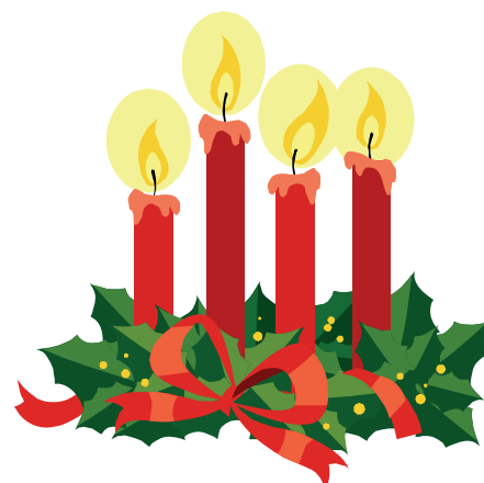
Fourth Sunday of Advent

We have moved the administration of a portion of our Pre-Authorized Giving Plan to the Archdiocese of Toronto. As a result, starting in December withdrawals from your bank account or credit card will be on the 20 th of each month (previously withdrawals were on the 15 th of the month).