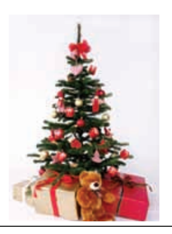
The Parish Staff

May your hearts be filled with light and hope this Christmas, as we celebrate God among us. May you have a Happy and Blessed Christmas!!!