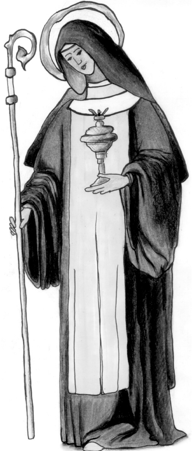
ST. GERTRUDE OUR PATRONESS

Durham Catholic District School Board 905-576-6150, www.dcdsb.ca