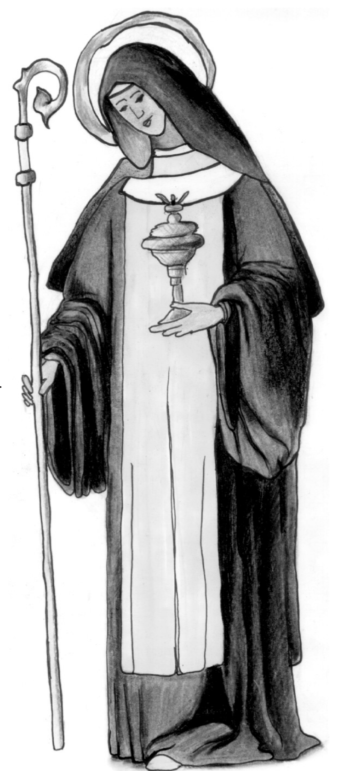
ST. GERTRUDE OUR PATRONESS

Durham Catholic District School Board 905-576-6150, www.dcdsb.ca