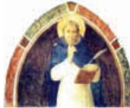
(St John Paul II)

"The search for intimacy with God involves the truly vital need of silence embracing the whole being, both for those who must find God in the midst of noise and confusion and for those who are dedicated to the contemplative life. To achieve this, their entire being has need of silence, and this requires zones of effective silence and a personal discipline to favor contact with God.