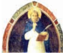
(St John Paul II)

"The search for intimacy with God involves the truly vital need of silence embracing the whole being, both for those who must find God in the midst of noise and confusion and for those who are dedicated to the contemplative life. To achieve this, their entire being has need of silence, and this requires zones of effective silence and a personal discipline to favor contact with God.