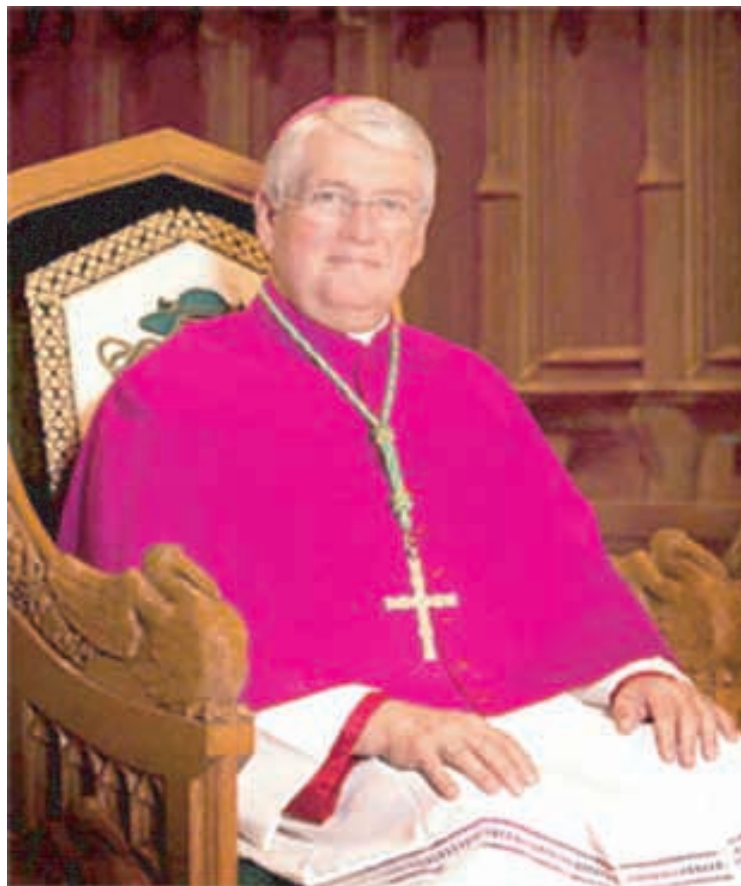
The Most Reverend D. DOUGLAS CROSBY, OMI, DD

To arrange pastoral visits to the sick in hospital or at home, please call the parish office.