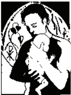
Happy Father's Day

God our Father, we give you thanks and praise for fathers young and old. We pray for young fathers, newly embracing their vocation. May they find courage and perseverance to balance work, family and faith in joy and sacrifice. We pray for our own Fathers around the world whose children are lost or suffering. May they know that the God of compassion walks with them in their sorrow. We pray for men who are not fathers but still mentor and guide us with fatherly love and advice. We remember fathers, grandfathers, and great grandfathers who are no longer with us but who live forever in our memory and nourish us with their love. Amen