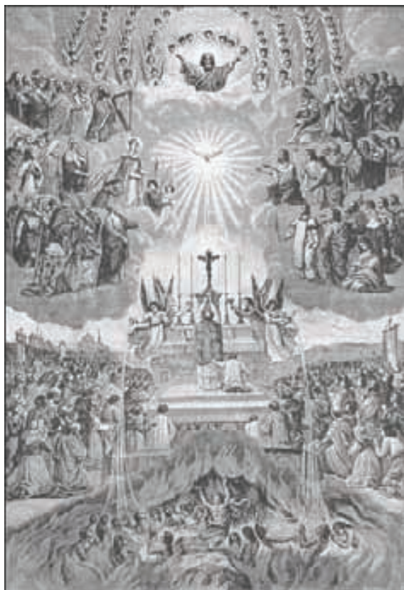
November is the Month of the Holy Souls in Purgatory!

SHEPHERDS TRUST Our priests faithfully serve our families, in our churches, schools, hospitals, nursing homes, missions and on our streets and for that we are very grateful. The Shepherds' Trust does more than just bridge the gap in our priest's retirement years; it says thank you in a very tangible way for the blessings we have received. Your generosity on November 12/13 is deeply appreciated.