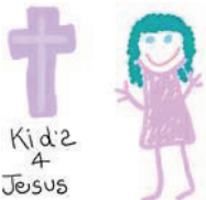
Kid's 4 Jesus