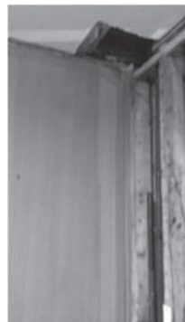
Picture of water pipes inside the wall. Water was leaking from a T-joint in the ceiling.

Thank you for your support of the once a month Building Fund . The building and the pastor are about the same age – really old! So it comes as no surprise that building parts wear out after sixty years. In January, a pipe in the rectory, part of the heating system, started leaking . That caused the pressure in the boiler to drop (a telltale sign of a leak in the system). Hearing water dripping behind a wall, the boiler technicians were called and a pipe needed to be replaced. The repair job was in an awkward spot. $1,800.00 later, all is well.