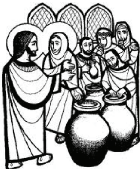
The Wedding Feast of Cana Isaiah 62.1-5 1 Corinthians 12.4-11 John 2.1-12

This Year is the Extraordinary Jubilee of Mercy