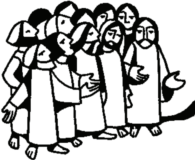
Jesus reads from the scroll of the prophet Isaiah

Nehemiah 8.2-4a, 5-6, 8-10 1 Corinthians 12.12-30 Luke 1.1-4; 4.14-21