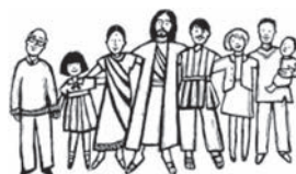
BROTHERS AND SISTERS IN CHRIST

Sin also divides us from one another since it's essentially a refusal to love. With sin we always put our own needs before those of our neighbor. Christ restores us to God's friendship. By the power of the Spirit we are able to reach out to our neighbor in forgiveness and reconciliation. Divisions are overcome and the Kingdom of God is seen to have come among us.