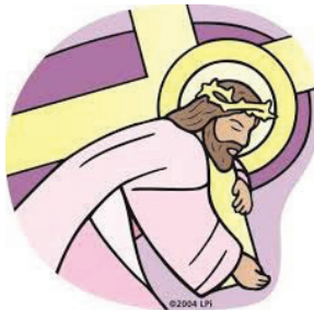
Friday Evenings in Lent

The Stations of the Cross are prayed every Friday in Lent at 7:30pm, except Taizé Friday on March 29th , starting Friday, March 8 th .