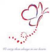
We carry them always in our hearts

There will be a second collection next week for the Evangelization of the Nations, otherwise known as World Mission Sunday. Every parish across the globe will celebrate this event. It is a global sign of the Universal Church and mission. ON this day, Pope Francis invites all Catholics to contribute to a special collection for the Propagation of the Faith. Your support will help missionaries in proclaiming the Gospel of joy and peace around the world. Please join in this special day that unites Catholics from all over the world through prayer and care for the Church's mission. Thank you for your support of this important work.