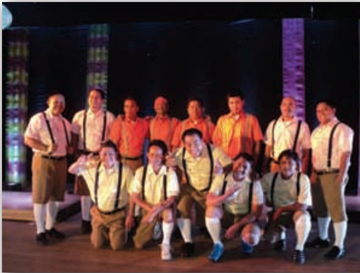
The Priests of Diocese of Malaybalay