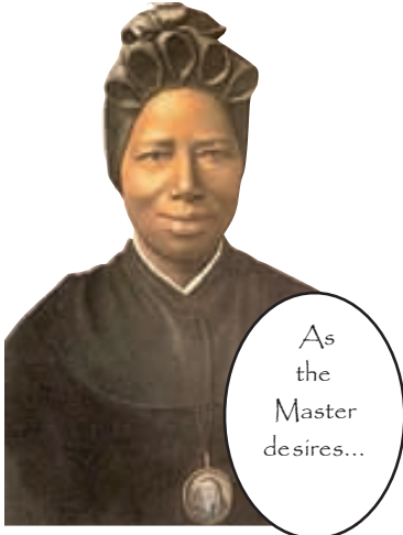
We celebrate Holy Mass at

OFFICE HOURS: Tuesday to Friday 9:00 AM to 6:00 PM