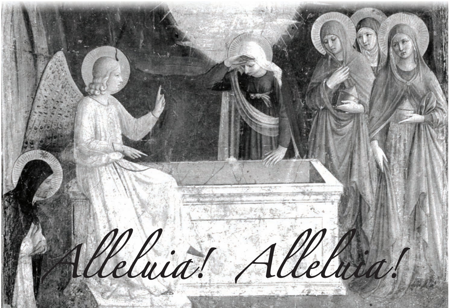
THE RESURRECTION OF CHRIST AND THE WOMEN AT THE TOMB; FRA ANGELICO; 1440-41

Since October 2007, we have been the home of the National Televised Daily Mass, reaching people in their homes all over Canada. The Daily Mass is broadcast six days a week on Vision TV, the Crossroads Television Network, and Salt and Light TV. You can also follow us on Facebook, Twitter and Instagram.