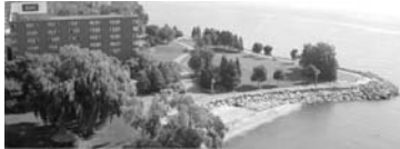
2020 Lakeshore Rd. Burlington on the Waterfront 905.631.6011