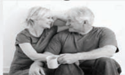
Think about it, Talk about it, Start the Conversation