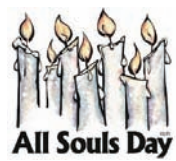
All Souls Day