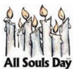
All Souls Day