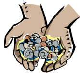
tithes and offerings

Regular $2,346.60 Initial Offerings $ 305.00 Total $2,651.60