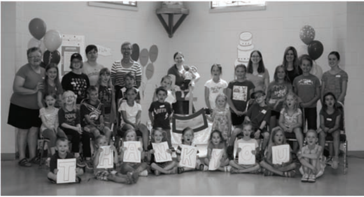
St. Teresa of Avila's Vacation Bible School in Elmira had a great week celebrating the gift of Life. THANK YOU TO THE CATHOLIC COMMUNITY FOUNDATION OF WATERLOO for their generous donation.