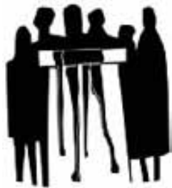
The Most Holy Body and Blood of Christ, Year B

Blood sprinkled on people and altar! Sacrificial blood of the new covenant poured out for us! We do not often think of taking part in these "messy" events for our salvation, yet Jesus our Messiah takes up the covenant of Moses, renews and fulfills it for us on his cross. He changes things once and for all so that we can, here and now, today, take part in his work, opening divine grace and life to the world. The Eucharist draws us into the work of his cross, his life-giving service.