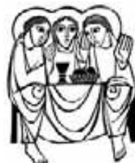
The Holy Trinity, Year B.

What's next for stewardship in the Archdiocese of Winnipeg? Come explore this question and engage in some creative thinking about discipleship and stewardship. We will explore the 10 virtues of the Disciple and Christian Steward. All are welcome! Saturday, June 23 rd , 9am to 1pm, St. Anthony of Padua Church Hall, 250 Burrin Ave, Winnipeg To register please contact the Archdiocesan Stewardship Office at 452-2227 ext. 228 or email stewardship@archwinnipeg.ca