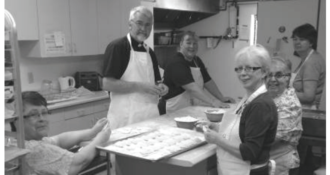
Our Pierogi Crew

Home made Pierogi Dinner Potato & Cheese Pierogies, Ham, Veggies, Dessert