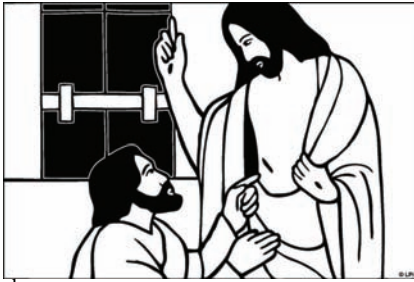
2 nd Sunday of Easter ~ 3 April 2016 Divine Mercy Sunday

Then he said to Thomas, "Put your finger here and see my hands, and bring your hand and put it into my side, and do not be unbelieving, but believe." Thomas answered and said to him, "My Lord and my God!" — Jn 20:27-28