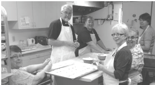
Our Pierogi Crew

Home made Pierogi Dinner Potato & Cheese Pierogies, Ham, Veggies, Dessert