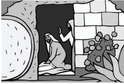
The Resurrection of the Lord ~ 5 April 2015

H e bent down and saw the burial cloths there, but did not go in. When Simon Peter arrived after him, he went into the tomb and saw the burial cloths there, and the cloth that had covered his head, not with the burial cloths but rolled up in a separate place.