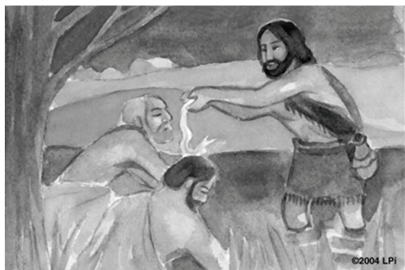
3 rd Sunday of Advent ~ 16 December 2018

As the people were filled with expectations, and all were questioning in their hearts concerning John, whether he might be the Messiah, John answered all of them by saying, "I baptized you in water; but one who is more powerful than I is coming." Luke 3:15-16a