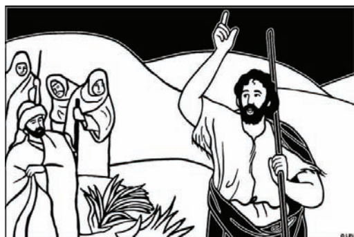
2 nd Sunday of Advent ~ 9 December 2018

“The voice of one crying out in the wilderness: ‘Prepare the way of the Lord, make his paths straight.’ Luke 3:4