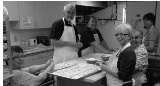
Our Pierogi Crew

Home made Pierogi Dinner Potato & Cheese Pierogies, Ham, Veggies, Dessert