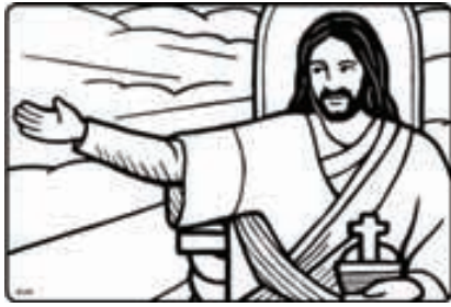
Christ the King ~ 23 November 2014

“Then the king will say to those on his right, ‘Come, you who are blessed by my Father. Inherit the kingdom prepared for you from the foundation of the world. For I was hungry and you gave me food, I was thirsty and you gave me drink, a stranger and you welcomed me, naked and you clothed me, ill and you cared for me, in prison and you visited me.’” — Mt. 25:34-38