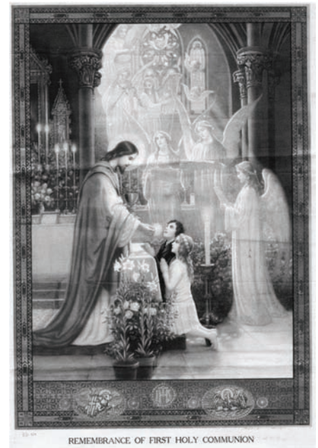
REMEMBRANCE OF FIRST HOLY COMMUNION

Congratulations to the children from St. Gabriel School who are receiving the Sacrament of First Eucharist this Sunday!