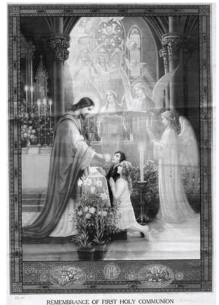
REMEMBRANCE OF FIRST HOLY COMMUNION

Congratulations to the children from St. Mark School who are receiving the Sacrament of First Eucharist this Sunday!