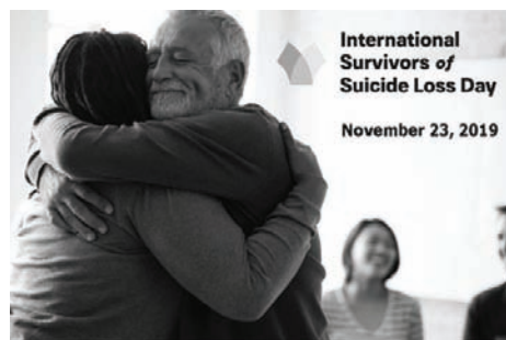
International Survivors of Suicide Loss Day November 23, 2019

You are not alone. On Saturday, November 23 , join a community of suicide loss survivors as we share stories of hope and healing. Location, 186 Morrison Road, Oakville. Time: 4:00-8:00pm, Contact: