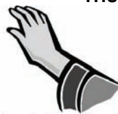
Anointing the sick

February 11 is World Day of the Sick where in many places churches offer the anointing of the sick celebrated within Mass. Our parish will hold a Healing Mass on Thursday February 9 at 7 pm. which will include the anointing of the sick with the Oil of the Infirm praying for God's healing and blessing upon those who are sick with various diseases, sicknesses and ills of mind and body.