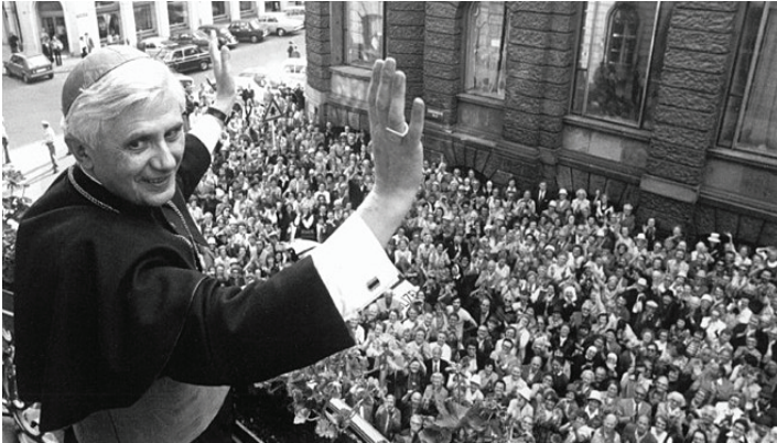
Archbishop Joseph Ratzinger in 1977

It is always a little sad when the miracle doesn't happen. So, when the Supreme Court waved its magic gavel last summer (in the U.S.) and rhetorically ended the citizens' debate over the newly discovered "right" to same sex marriage, the decision was greeted with frustration and a deep sense of betrayal on the part of many faithful Catholics. We had hoped our highest court still capable of a rational ruling.