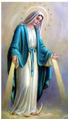
Our Lady of the Immaculate Conception