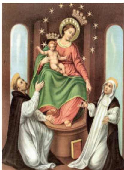
Our Lady of the Rosary, Pray for us!

Sunday Contributions..... $ 615.00 Evangelization of Nations ..... $ 20.00