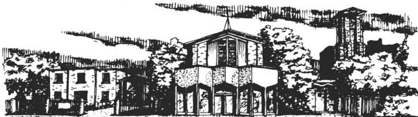
Saints Peter and Paul Church