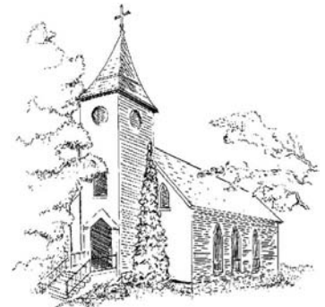
St. Mary of the Rosary, Hepworth Sunday 9:00 am (Nov-Mar)