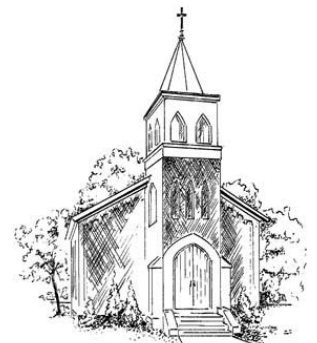
St. Stanislaus, Chatsworth Sunday 9:00 am