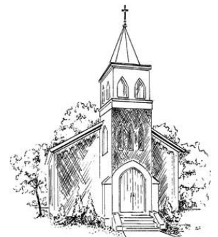
St. Stanislaus, Chatsworth Sunday 9:00 am