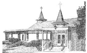
Holy Family, Sauble Beach Sunday 9:00 am (Apr-Oct)