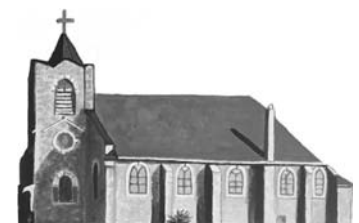
St. Mary's, Cape Croker Sunday 1:00 pm