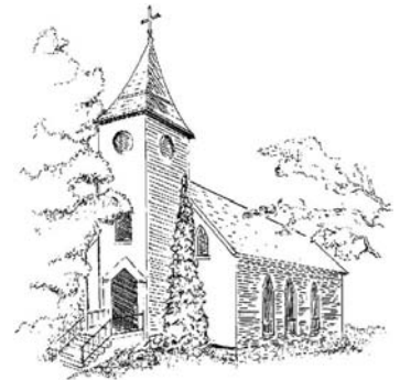
St. Mary of the Rosary, Hepworth Sunday 9:00 am (Nov-Mar)