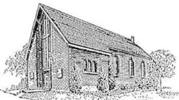
St. Mark, Lions Head Saturday 9:30 am