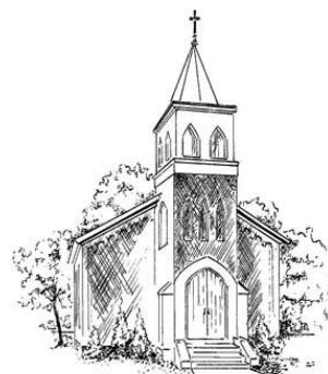
St. Stanislaus, Chatsworth Sunday 9:00 am