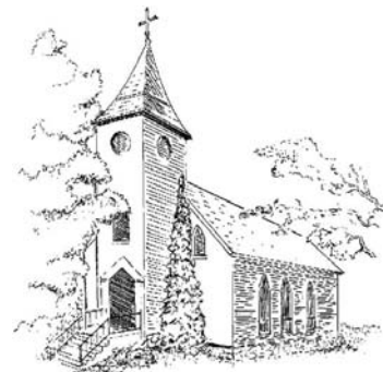
St. Mary of the Rosary, Hepworth Sunday 9:00 am (Nov-Mar)