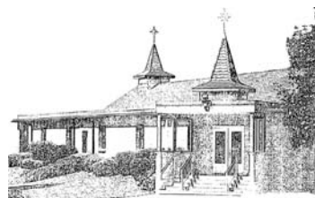
Holy Family, Sauble Beach Saturday 5:00 pm (July-Aug) Sunday 9:00 am (Apr-Oct)