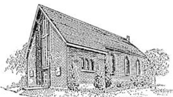
St. Mark, Lions Head Saturday 9:30 am