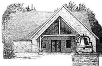
St. Thomas The Apostle, Tobermory Saturday 11:30 am