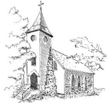
St. Mary of the Rosary, Hepworth Sunday 9:00 am (Nov-Mar)