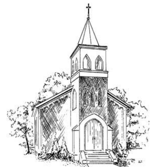
St. Stanislaus, Chatsworth Sunday 9:00 am