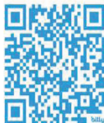
Day Program Registration

Day Program | Grades 1-6 July 27-31, 2026 (8:45am-2:30pm) Evening Program Grades 6-12 July 26-30, 2026 (6-9 pm)