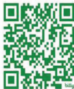
Evening Program Registration