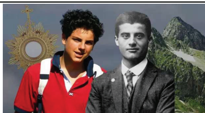
St. Carlos Acutis & St. Pier Giorgio Frassati Pray for us

Secondly, we should be an example to others of the salvific power of God’s forgiveness in our own lives, so that they may be inspired by our witness and be encouraged to turn to God’s mercy as well. Perhaps one concrete practice we could do adopt is inviting others to join us in receiving the sacrament of Confession. Therefore, as true grateful disciples of Christ let us continually seek His gift of forgiveness and ask ourselves how are we sharing the good news of this great gift with those whom we encounter?